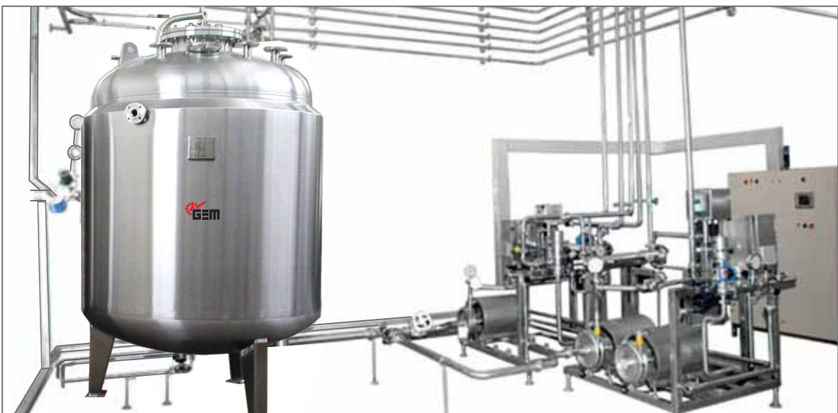
PW / WFI & Pure Steam Distribution Loop System