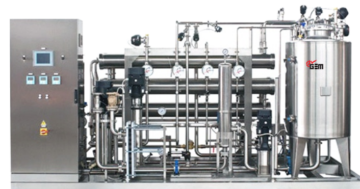
Purified Water Generation System