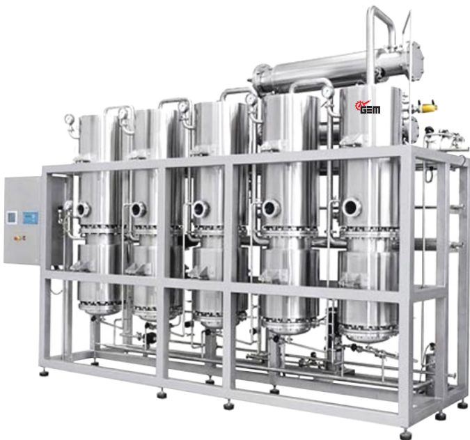
Multi Column Distillation Plant - Cap : 50 Ltr to 5000 Ltrs