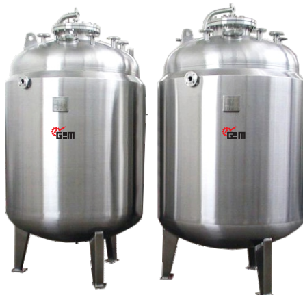
PW & WFI Water Storage Tanks