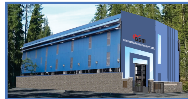
Unit : II - Ambernath, Thane

GEM Pharma is a global turnkey solutions provider for Pharma, Biotech, Injectable / LVP / SVP, Lifesciences, Healthcare, Chemicals, Cosmetics, Beverages, Food, Distilleries, & Water Systems. It is one of the Leading quality oriented manufacturer in India suppling wide turnkey projects especially in Pharma Industries.