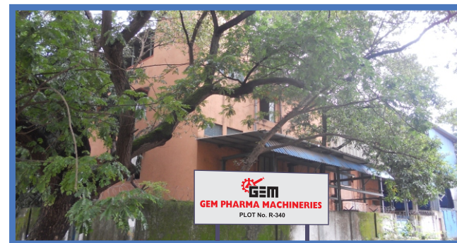
Unit : I - Navi Mumbai

We have a dedicated staff who strictly follows all rules and regulations, especially regarding completion of jobs and delivery of products on time. our after-sales engineers remain alert at the 'back and call' of our clients. They are the professionals who maintain the healthy life line of the products and projects and also train the maintenance staff of the respective client or operator as the case may be.