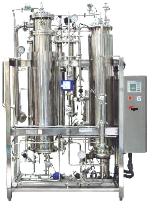
Pure Steam Generator Cap. 100 Kgs / 2000 Kgs