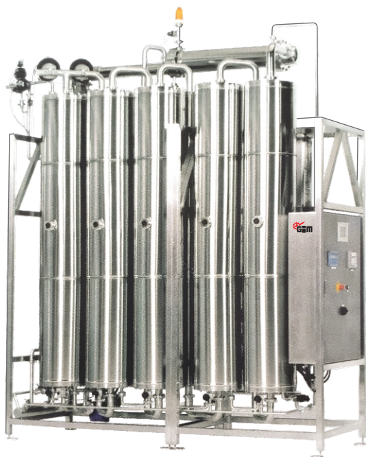
Combo Still Generation Plant